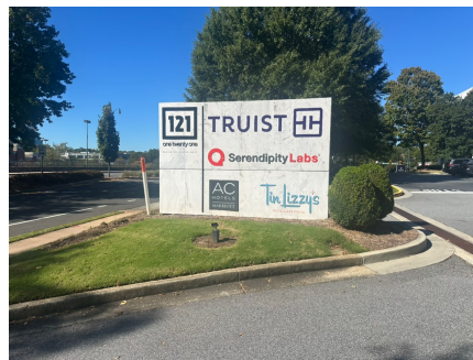
Street View: Expansive Work Space & AC Hotel

Put the meeting address in your GPS or phone