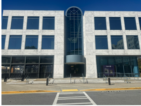
121 Building Entrance (Truist Bank) Expensive Work Space 2 nd Floor Start time is 8:30AM