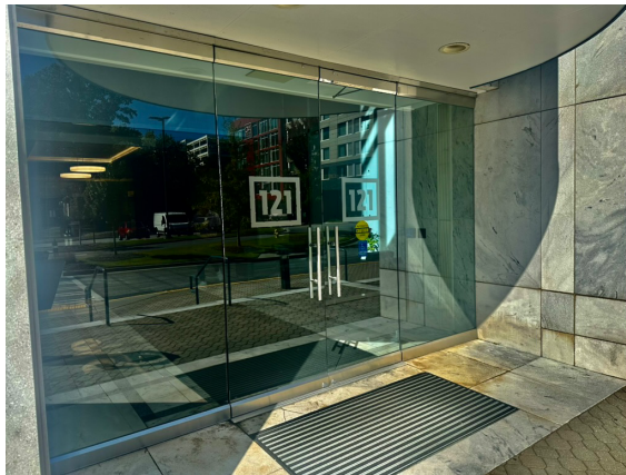
121 Building Entrance (Truist Bank) Expensive Work Space 2 nd Floor Start time is 8:30AM